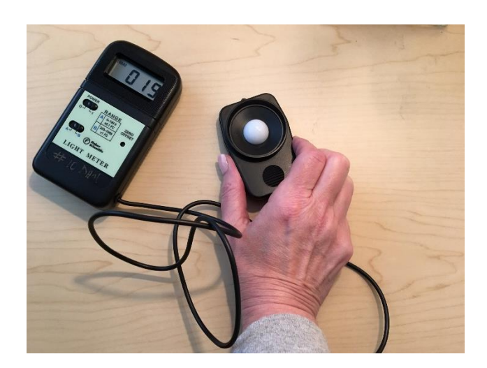
Figure 1. Light Meter in Use

The researchers measured the electric light levels in footcandles (fc) on horizontal and vertical surfaces, using a Fisher Science Education Model #S90918 pocket digital light meter. Refer to Figure 1 for an image of the light meter in use.