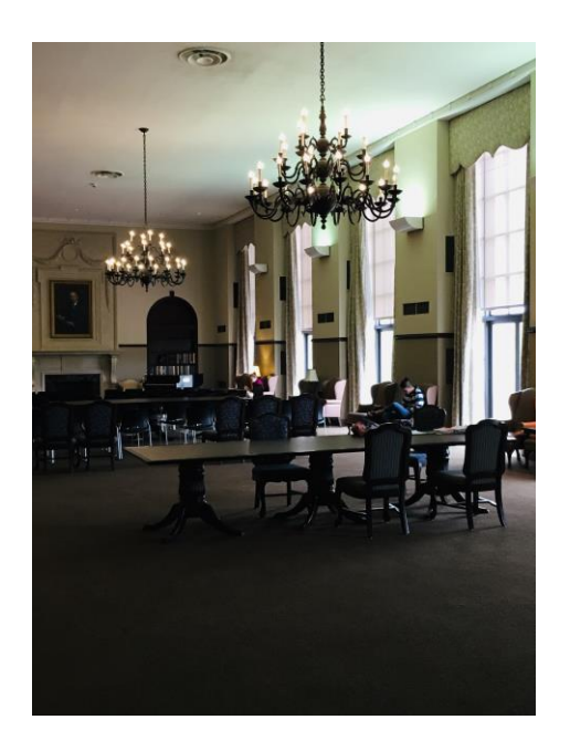
Figure 3. Existing Conditions with View of Main Area, LED Chandeliers,

Metal Halide Uplight Scoop Light Fixtures