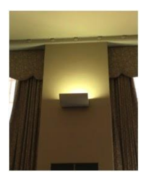
Figure 5. Existing Metal Halide Scoop Uplight

The study examined existing lighting within a University Library's Browsing Room. The researchers found that the existing Main Room lighting in the Browsing Room consisted of (13) uplight scoop light fixtures lamped with clear, 400 watt metal halide lamps. Refer to Figure 5 for a photograph of an existing uplight scoop fixture.