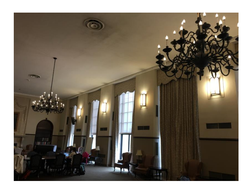
Figure 6. Renovated lighting in the Main Area with new wall sconces

According to International Energy, the allowable Lighting Power Density (LPD) for a library is 1.3. The researchers calculated the anticipated LPD for the proposed lighting renovation of the Browsing Room and compared the anticipated LPD in the proposed renovation to the allowed LPD. The new fixtures were 266.67 watts each and were 90 lumens per watt. The new fixtures contributed 0.98 lumens per watt, far lower than the 1.3 LPD allowed by code.