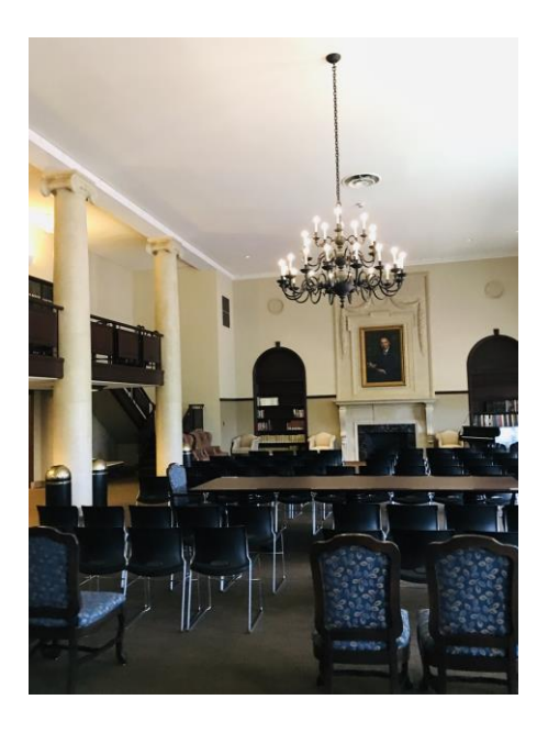
Figure 2. Existing Conditions with View of Main Area, LED Chandeliers, Mezzanine, Stairs, Fireplace Surround and Bookshelves

Refer to Figures 2 and 3 for photographs of the existing Browsing Room conditions.