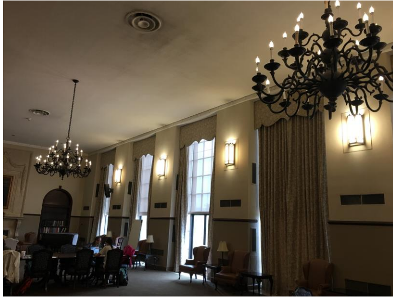
Figure 6. Renovated lighting in the Main Area with new wall sconces

According to International Energy, the allowable Lighting Power Density (LPD) for a library is 1.3. The researchers calculated the anticipated LPD for the proposed lighting renovation of the Browsing Room and compared the anticipated LPD in the proposed renovation to the allowed LPD. The new fixtures were 266.67 watts each and were 90 lumens per watt. The new fixtures contributed 0.98 lumens per watt, far lower than the 1.3 LPD allowed by code.