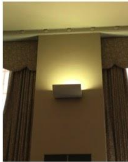
Figure 5. Existing Metal Halide Scoop Uplight

The study examined existing lighting within a University Library's Browsing Room. The researchers found that the existing Main Room lighting in the Browsing Room consisted of (13) uplight scoop light fixtures lamped with clear, 400 watt metal halide lamps. Refer to Figure 5 for a photograph of an existing uplight scoop fixture.