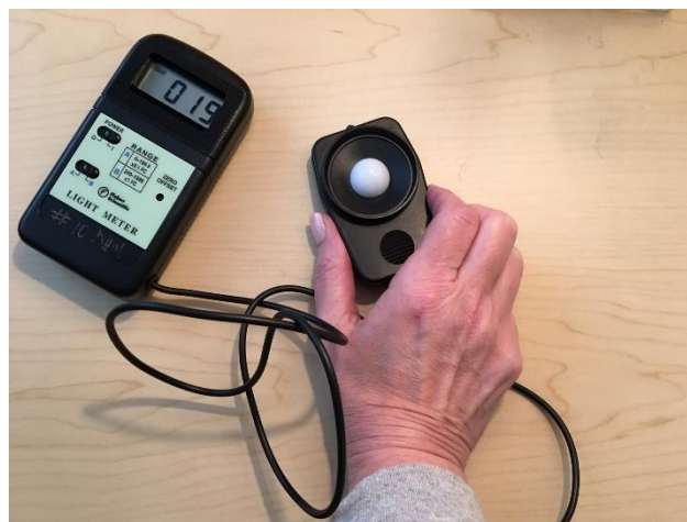
Figure 1. Light Meter in Use

The researchers measured the electric light levels in footcandles (fc) on horizontal and vertical surfaces, using a Fisher Science Education Model #S90918 pocket digital light meter. Refer to Figure 1 for an image of the light meter in use.