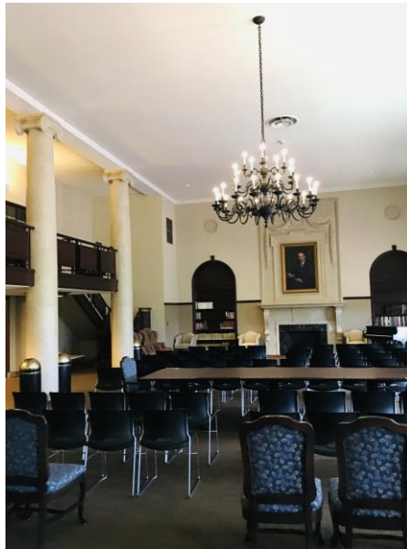
Figure 2. Existing Conditions with View of Main Area, LED Chandeliers, Mezzanine, Stairs, Fireplace Surround and Bookshelves

Refer to Figures 2 and 3 for photographs of the existing Browsing Room conditions.